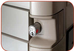
Core Removable Lock*

For additional accessories see CapsaHealthcare.com