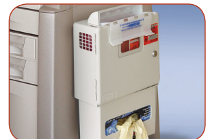
Sharps / Glove Box