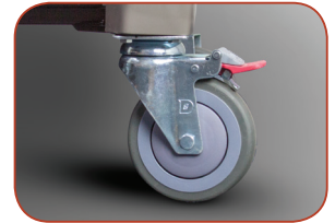
5" Brake Caster*