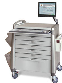
Tech-Ready model available

Avalo accommodates all popular compliance packaging systems such as TCGRx ATP®, AutoMed/ARxIUM FastPak™ EXP, Parata PASS™, MTS® Opti-Pak™, Opus®, and Dispill®