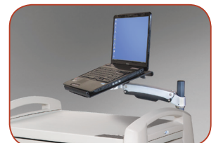
Laptop Arm & Tray