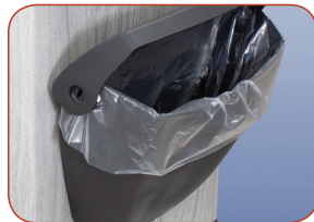
Waste with Lid*