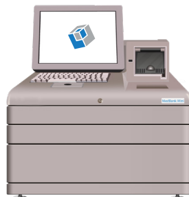
MedBank 200 22.8"W x 26.9"D x 27.7"H