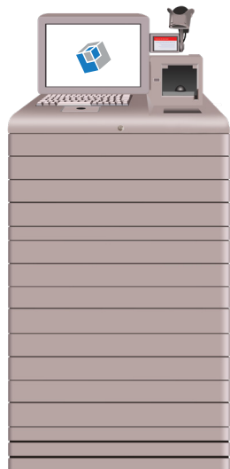
MedBank 500 22.8"W x 26.9"D x 54.3"H