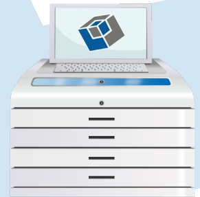
MedBank Mini 26.5H x 19W x 18.4D

Schedule a complimentary on-site assessment.