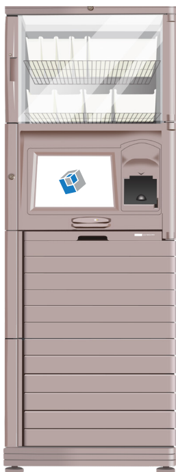
MedBank 1000 31"W x 28"D x 79.5"H